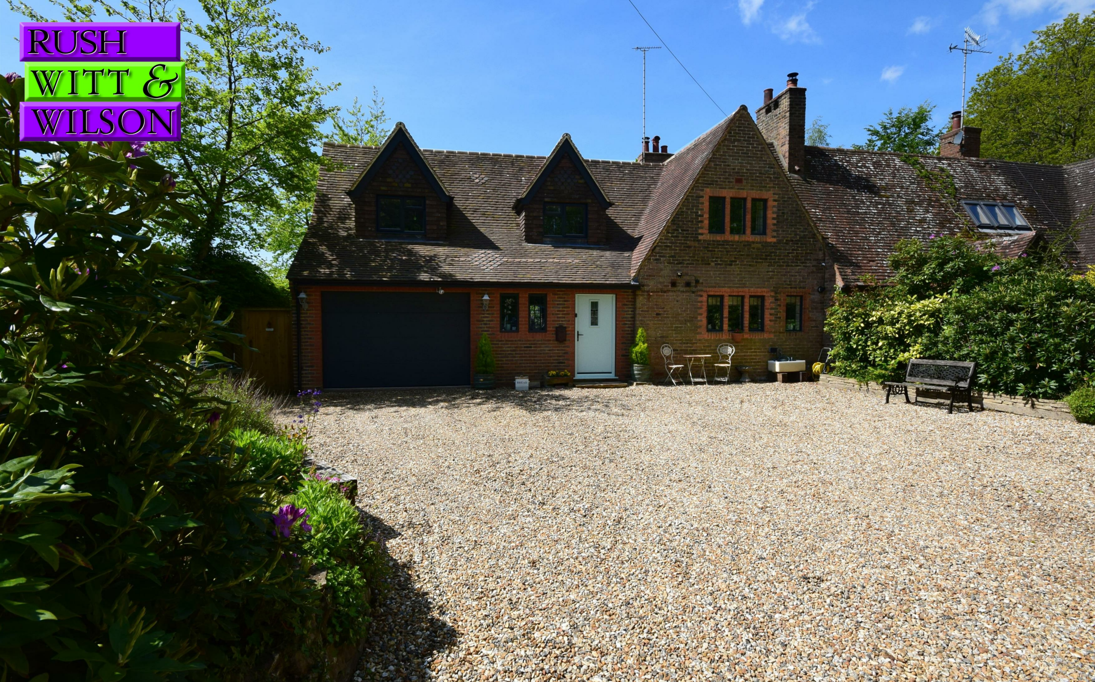
Gateway Cottage Sandhurst Lane, Bexhill-On-Sea, East Sussex TN39 4RG £685,000